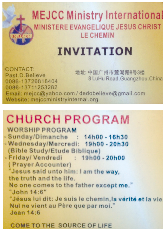
Photograph 3. 26 September 2016

because I could not find anything like a church at 8 Lu Hu Road. There were buildings number 7 and 6, but no number 8. According to the map, 8 was beside the hotel, but I could only find the hotel. I asked local residents, but no one seemed to know building number 8.