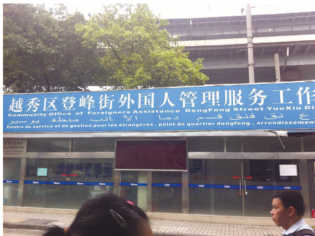
Photograph 1. Photograph by the author, September 2012

second measure is an online system in order to let foreigners do formalities directly online anytime. The system is convenient for registering and applying for a visa extension. The third one is to establish a so-called “model community”. Every year the authorities select a community where foreigners live mixed with local residences without any incidents as a model. The community office recruits foreigners as volunteers, manages the community with the help of local residents, and promotes the mixed residence of foreigners and locals. The last measure is to attract the representatives of foreign chambers of commerce where foreigners are members, listen to their advice, and inquire after their needs in order to improve various services. In addition to the above-mentioned measures, the Yuexiu district office reorganized the department that administrated foreigners to better clarify the responsibilities of offices at the district level. They established a Foreigners’ Affairs Service Center in lieu of a community office. This center deals with the whole range of issues related directly to foreigners. It is believed to be more efficient. Photograph 2 below shows the same place as photograph 1. As we can see, the street became clean and beautiful. The sign above the entrance is smaller now and does not look as threatening as before.