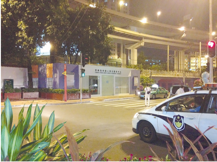
Photograph 2. Photograph by the author, 24 September 2015

foreigners to register in the community and to hire college students who can speak English as volunteers to help foreigners register. The second was to check the number of foreigners in the community by cooperating with those landlords who rent rooms to foreigners. The third step was to let foreigners who can speak Chinese fluently participate actively in community affairs. By doing that, he wanted to make foreigners feel at home when they lived in the community. He proposed starting free-of-charge Chinese language lessons; letting foreign children attend local schools; offered various suggestions to the local government on administration of foreigners; provided opportunities for religious events; and held happenings in communities, providing foreigners with a chance to communicate with local Chinese. The last step was the local administration office. Local police officers have to cooperate with each other, collecting information throughout the entire community in order to take preventive measures in terms of community affairs, etc [6, p. 36–38]