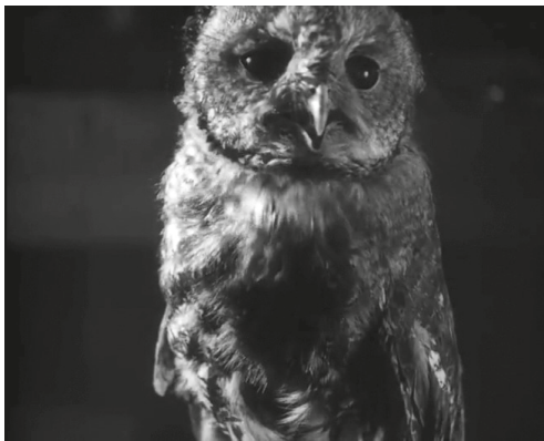
Fig. 8. Strike , directed by Sergei Eisenstein (1925; Paris: Carlotta Films, 2008), DVD