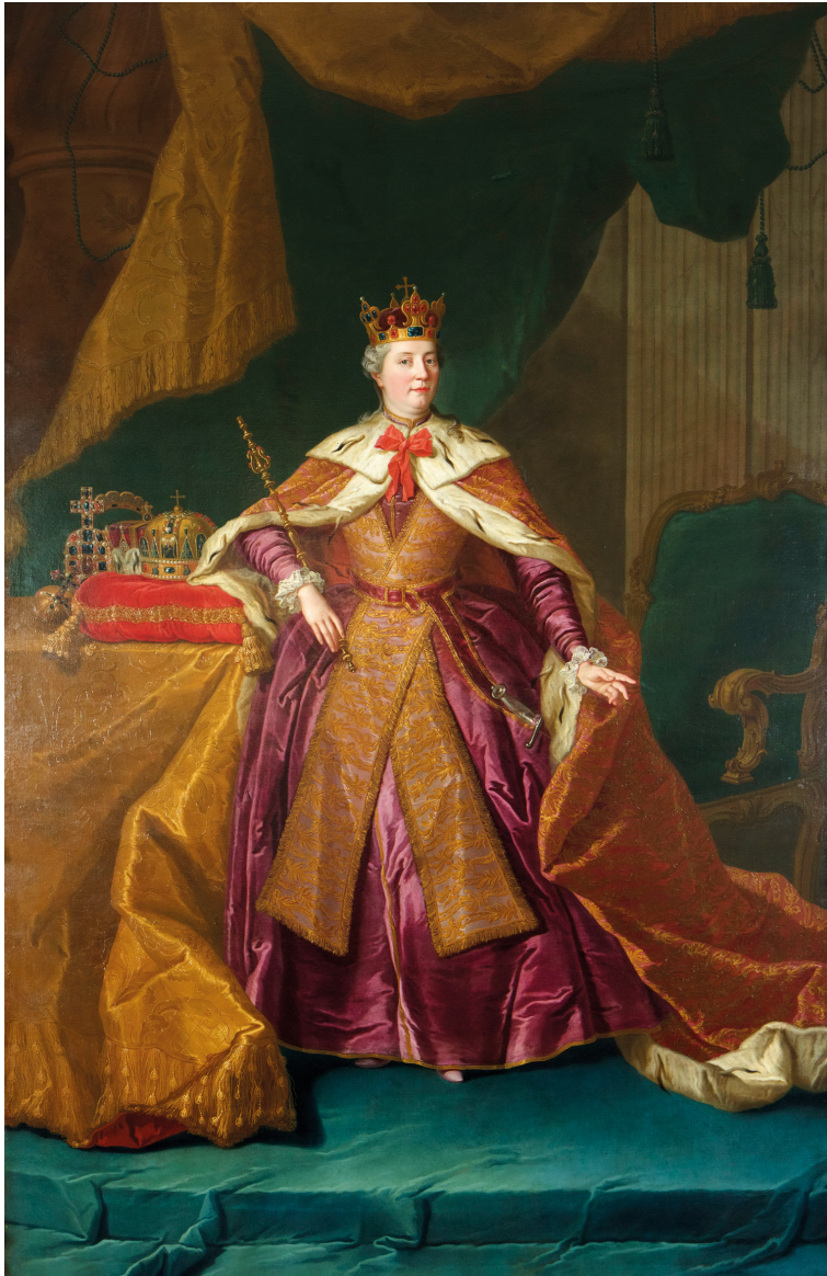
Fig. 10. Martin van Meytens the Younger. Maria Theresia as Queen of Bohemia. Oil, canvas. Bundeskanzleramt, Vienna / Andy Wenzel

accurately, the message expressed in such portraits can be formulated as following: not an individual crown, but a conglomerate of crowns provide power over the Empire.