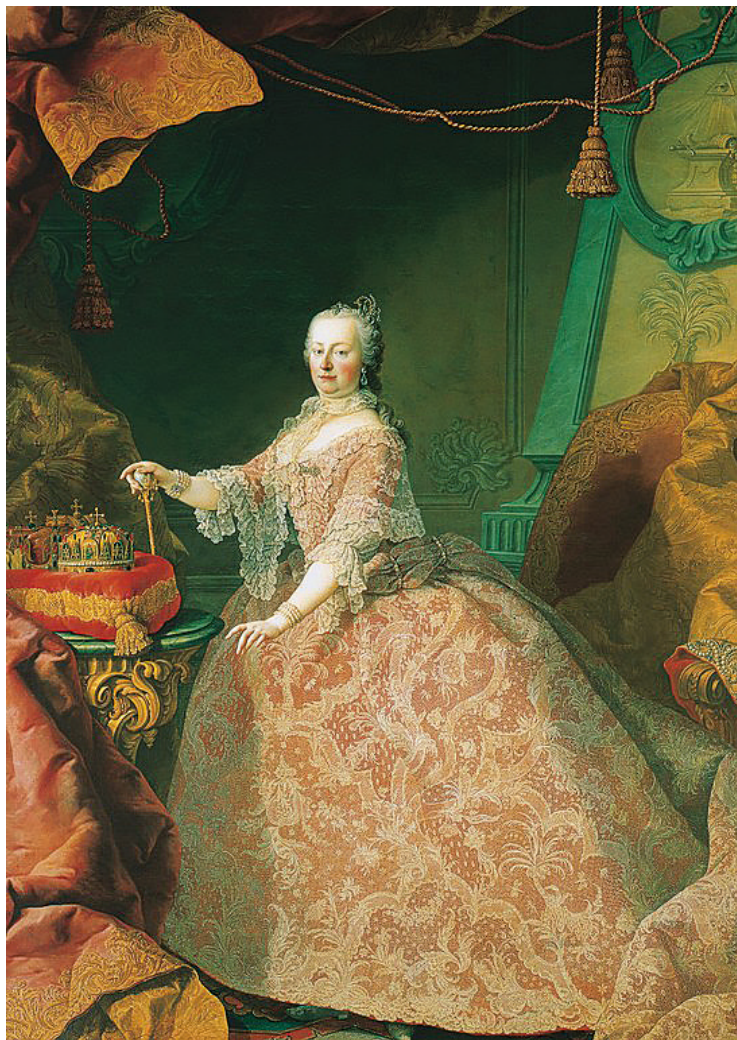
Fig. 11. Martin van Meytens the Younger. Maria Theresa in a Pink Dress. c. 1750–1755. Oil, canvas. Kunsthistorisches museum, Vienna, Schloss Schönbrunn, inv. no. GG 8762

which was painted after transformation of private union of France and Navarre into real one in 1620. It seems to be only in the 18 th century when oil portrait was becoming a preeminent form of representation of a ruler and only with the Habsburgs and rulers of Saxony and Poland that the idea of power over several lands became expressed in the most laconic and visually powerful form — that of an oil portrait with several crowns. Portraits of Polish and Saxonian rulers certainly must have been familiar to Torelli, who worked at the court of August III of Poland (Frederick August II of Saxony) in Dresden before his arrival to Russia, and could have been familiar to Catherine, especially taking into account her proximity with Stanislaw August Poniatowski in the years preceding her ascension to the throne. By the time of Catherine's coronation, such a large number of portraits of Maria Theresa with multiple crowns were created that we can safely assume they were