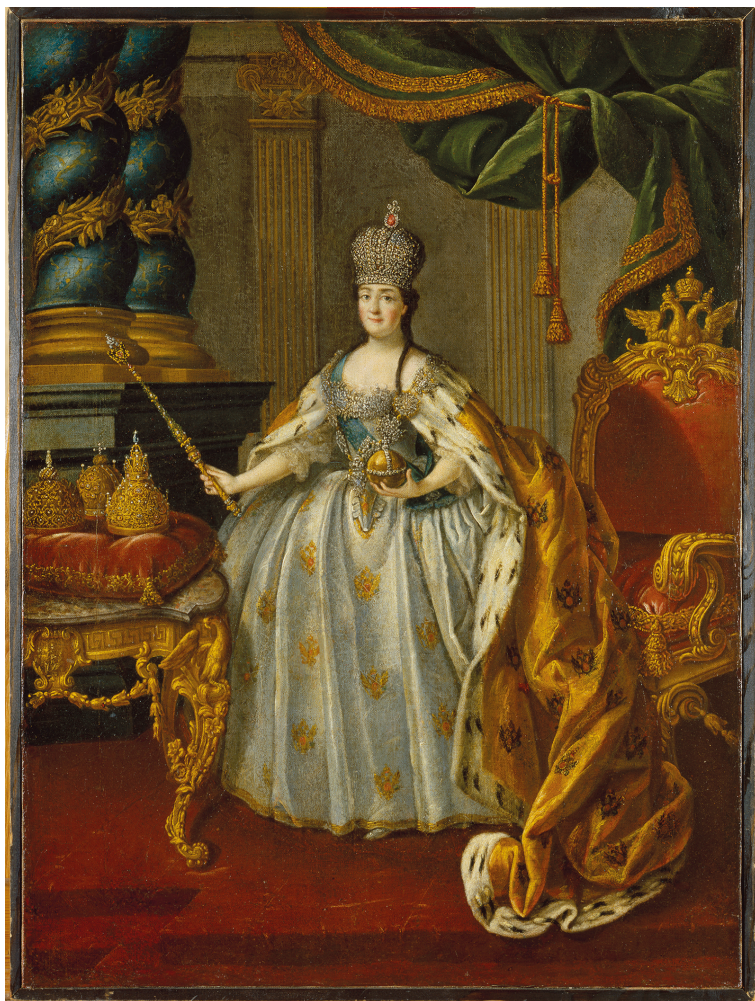
Fig. 2. Aleksei Antropov. A Copy after Stephano Torelli's "Coronation Portrait of Catherine II". Before 1766. Oil, canvas. 51×38. State Hermitage, Saint-Petersburg, inv. no. ЭРЖ-570

European counterparts; 4) to reveal the peculiar features of using the motive of crowns in Torelli's "Coronation Portrait of Catherine II".