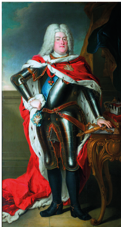
Fig. 7. Silvestre, Louis, de. Portrait of August III of Poland (August II of Sachsen). 1733. Oil, canvas. 205 × 90. Stadtgeschichtliches Museum Leipzig, inv. no. Fürstenbild Nr. 26

w Krakowie, inv. no. III-ryc.-30345 [XXIX]) and a medal minted to commemorate pacification of Sejm of 1736 and glorify August III in which the two countries are shaking hands (plaster cast of the medal from the reign of Augustus III, 2 nd half of the 19 th century, Muzeum Narodowe w Krakowie, inv. no. IX-MP-249/70 [XXX]). The symbolism of the two crowns in the time of August II entered the art both in the medium of portrait engraving (“Portrait of Friderikus Augustus”, c. 1696, engraving, etching, Muzeum Narodowe w Krakowie, III-ryc.-30543 [XXXI]) and oil portrait (“Portrait of August II” by Louis de Silvestre, 1718, Gemäldegalerie Alte Meister, Dresden, inv. no. Gal.-Nr. 3943 [XXXII], “Portrait of Christiane Eberhardine, Spouse of August II”, c. 1720, Gemäldegalerie Alte Meister, Dresden, Gal.-Nr. 3948). Oil portraits with two crowns gained special popularity under his successor (“Portrait of August III” by Louis de Silvestre, c. 1737, Muzeum Narodowe w Krakowie, Pałac Biskupa Erazma Ciołka [XXXIII]; “Portrait of August III” by Louis de Silvestre, 1733, Stadtgeschichtliches Museum, Leipzig, inv. no. Fürstenbild Nr. 26, fig. 7; “Portrait of Maria Josepha, Spouse of August III” by Louis de Silvestre, 1737, Gemäldegalerie Alte Meister, Dresden, Gal.-Nr. 3954, a copy after it in Stadtgeschichtliches Museum Leipzig, oil, canvas. 158 × 120, inv. no. XXVII/169, fig. 8).