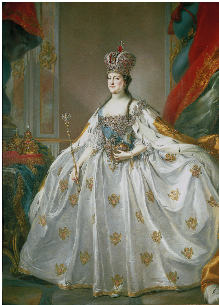
Fig. 1. Stephano Torelli. Coronation Portrait of Catherine II. Between 1763 and 1766. Oil, canvas. 244 × 178. State Russian museum, Saint-Petersburg, inv. no. Ж-5808

(1722-1782), a Danish artist active in Russia from 1757 to 1772. The other is a piece by the Italian painter Stephano Torelli (1712-1780) (fig. 1), a pupil of Francesco Solimena, who worked in Bologna, Venice, in Dresden and in Lübeck. In 1762 Torelli arrived in Russia upon the invitation of the President of the Academy of Fine Arts Count Ivan Shuvalov.