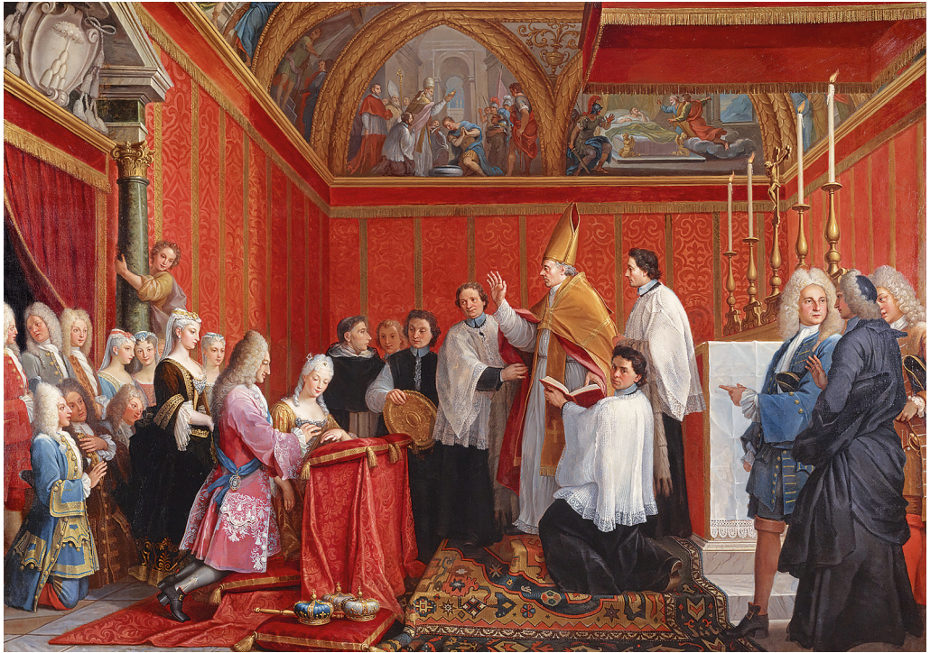
Fig. 5. Agostino Masucci, The Solemnisation of the Marriage of James III and Maria Clementina Sobieska . c. 1735. Oil, canvas. 243.50 × 342.00. National Galleries of Scotland, Edinburgh, inv. no. PG 2415. Purchased 1977 with assistance from the Art Fund, the Pilgrim Trust and private donors