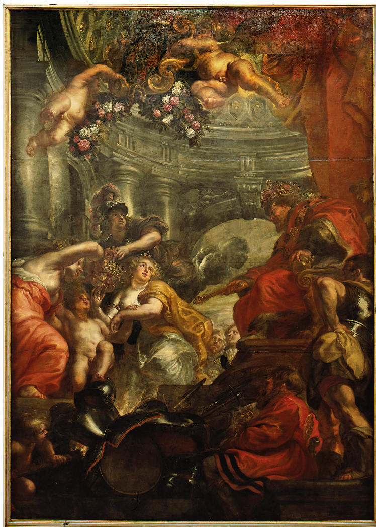
Fig. 4. Sir Peter Paul Rubens and studio. The Union of the Crowns of England and Scotland. c. 1632–1634. Oil, canvas. 762 × 549. Royal Collection Trust / © Her Majesty Queen Elizabeth II 2020. RCIN 408417. Accessed January 21, 2020. http://www.rct.uk/collection/408417

c. 1714–1727, engraving, 11.5 × 16.3 cm /sheet of paper/, inv. no. RCIN 603763 [XXVII]), or both (“Portrait of George II”, c. 1727–1760, engraving, 11.3 × 15.5 cm /sheet of paper/, inv. no. RCIN 603844 [XXVIII]).