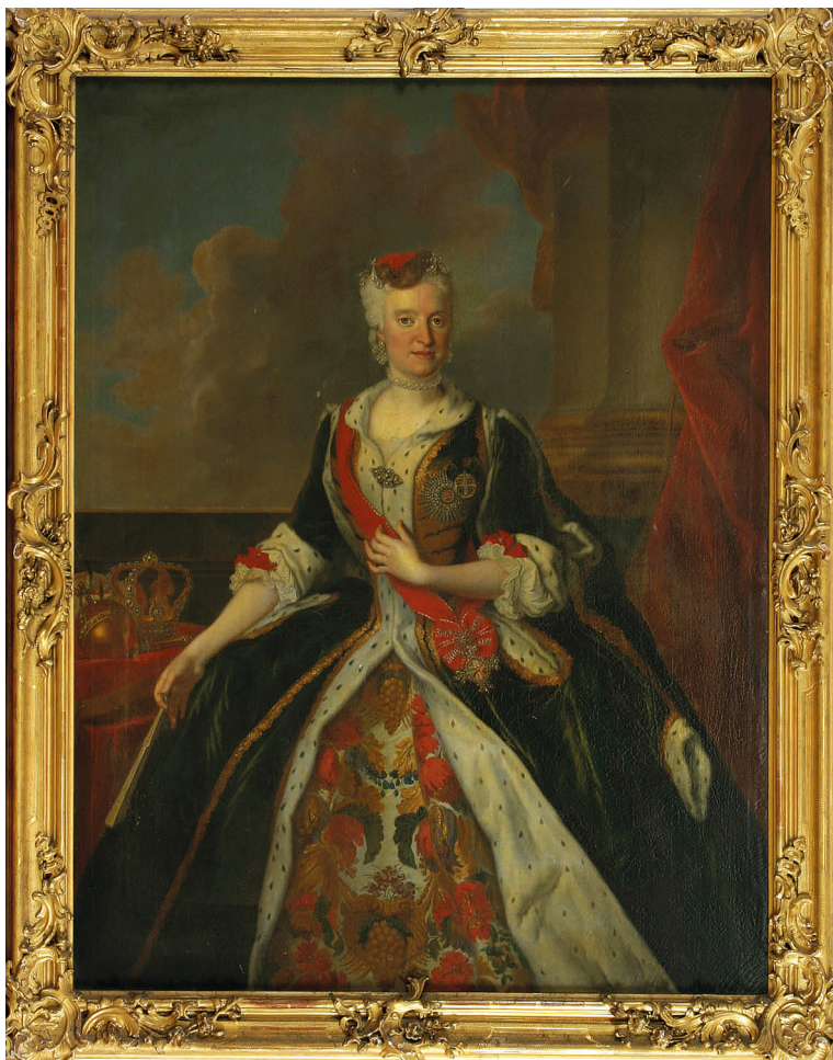
Fig. 8. Silvestre, Louis, de (after). Portrait of Maria Josepha, Spouse of August III of Poland (August II of Sachsen). After 1737. Oil, canvas. 158 × 120. Stadtgeschichtliches Museum Leipzig, inv. no. XXVII/169

from the National Gallery of Ljubljana, Maria Theresa is depicted with her hand resting on three crowns — those of Archduke of Austria, Queen of Bohemia and Hungary (National gallery of Slovenia, Ljubljana, oil, canvas, 280 × 184,5 cm) [41, p.37–8; XXX–IV]. The combination of the crowns of Bohemia, Hungary and Rudolf II can be seen in Versailles portrait of Maria Theresa as a Widow (Austrian Master of the 18 th century, Versailles) [41, p.299]. Finally, four crowns — Hat of Archduke of Austria, crowns of Bohemia and Hungary and Rudolph II's crown are present in Martin van Meytens's portraits from Deutsches Historisches Museum, Berlin (c. 1745, oil, canvas, 229 × 146 cm) [XXXV] and Martin van Meytens' "Maria Theresa in a Pink Lace Dress" (c. 1750–1755, oil, canvas, Kunsthistorisches museum, Vienna, Schloss Schönbrunn, fig. 11) [42, p. 19] to name just a few examples.