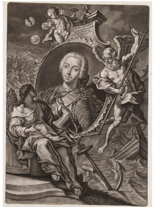
Fig. 6. Gabriel Bodenehrs after Domenica Dupra. Portrait of Charles Edward Stuart . Mezzotint. 44.0 × 31.2. Royal Collection Trust / © Her Majesty Queen Elizabeth II 2020. RCIN 603615. Accessed January 21, 2020. www.rct.uk/collection/603615