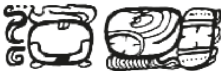
Fig. 4. Detail of Taxin Chan Plate. Drawing by G. Krempel

K'AK'-yo-'OL-la k'ahk' yohl fire 3SE-heart “fire (is) his heart” “he (is) ireful”