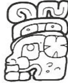
Fig. 8. Detail of La Rejoya (Caracol) Stela 3 [Martin S., Grube N., 2008]

K'AK'-'u-JOL k'ahk' 'ujol fire 3SE-head “fire (is) his head” “he (is) ireful”