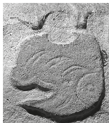
Fig. 2. Detail of stair block in Anonal.

K'AK'-TI' k'ahk' ti' “fire-mouth” “anger”