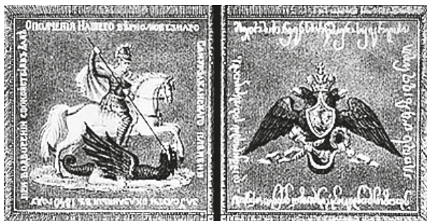
Fig. 2. The banner of the Samurzakan militia

In June 1864, the Abkhazian principality was abolished. On 14 August 1864, a new administrative and territorial unit was set up, leading to reorganizing a number of adjacent territories: the Sukhum Military Department. The new administrative unit included Abkhazia, as well as the Tsebelde and Samurzakan pristavstvos 47 . From our point of view, attaching Samurzakan to the Sukhum Military Department might have been an attempt of achieving an artificial balance between religious confessions in the region.